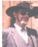
Paul Myers Amazing List Machine